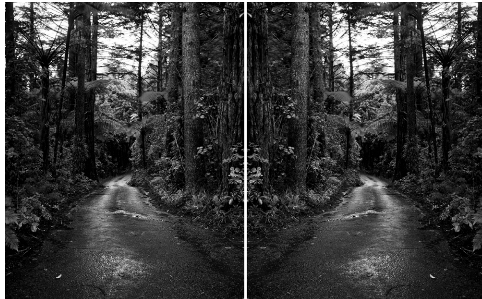
Sleeper, Lucy's Gully, South Taranaki, 2004.