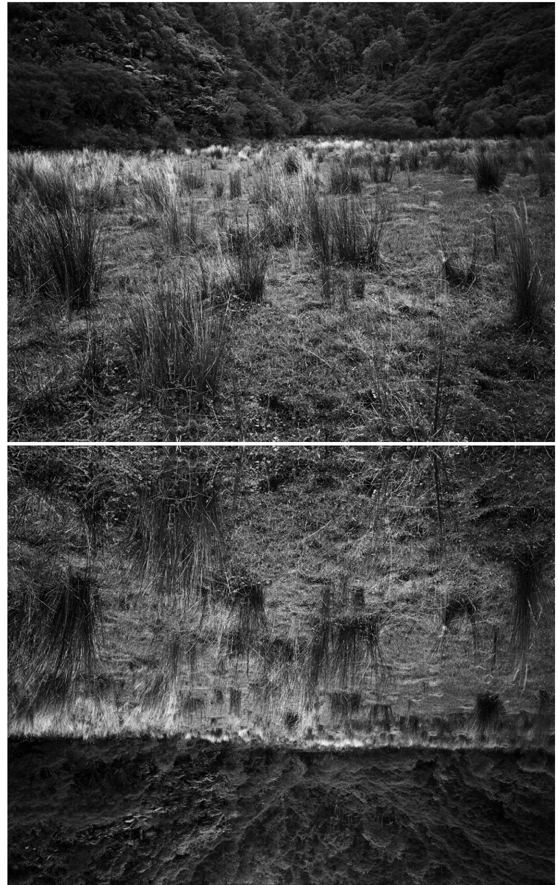
Theatre, Uruti Valley, Taranaki, 2004.